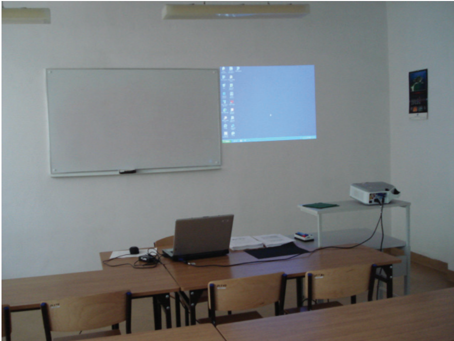
Fig. 1. View of the lecture room

In addition to the basic theoretical knowledge, students are acquainted with the current HCP production profile. Specialists from various production departments are invited to lecture and exchange their welding and other technology experiences and discuss with the students. Moreover, participants are provided with a variety of welding technical solutions based on the current production of HCP and the technical problems they may face at the future workplace. Such diversification of the course increases its efficiency.